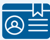
Memberships & Associations