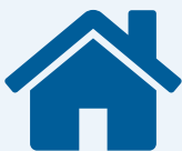
Housing & Economic Development