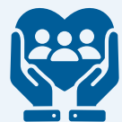
Social & Human Services