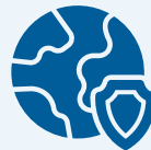
Environmental & Animal Welfare