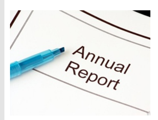
Tips and tools for better annual reports. At

in 2016. Blackbaud reports that mobile conversions last year have reached a new record, with 19 percent of donations and 23 percent of event registrations made from a mobile device.