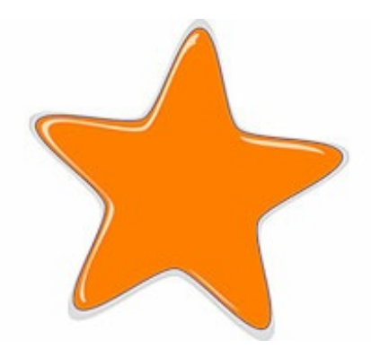
Performance appraisal done early and often. Whether it's aimed at getting the best possible results now or success down the road, nonprofit senior managers need to take steps to seek and promote excellence in all employees.