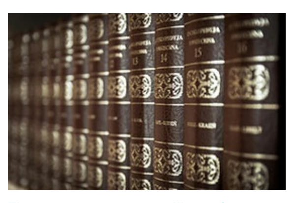
Five ways to start a story library for your nonprofit. Collecting stories is one of the top challenges that nonprofits site when it comes to successful storytelling.