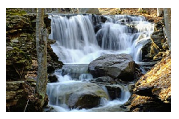
A collaborative form of "big bet" philanthropy. Blue Meridian Partners is a new capital aggregation collaboration that will invest at least $1 billion in nonprofits to make a national impact on economically disadvantaged children and youth.