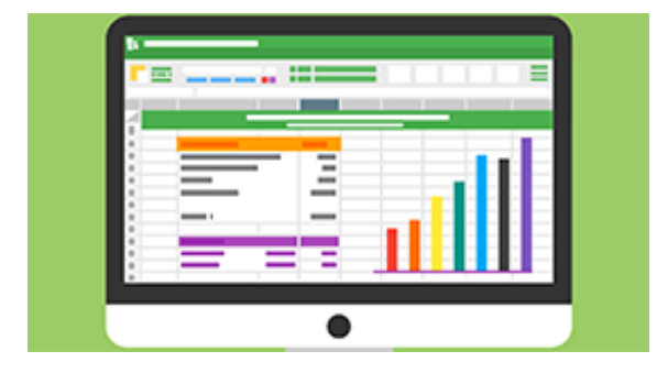
Data and infographics: Telling your nonprofit's story. Whether it's a picture of people being helped or a colorful chart showing the total amount of funds raised, visuals strike a chord.