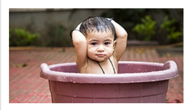
The nonprofit overhead baby and the bathwater: A need-to-know for boards. A thorough understanding of overhead can suggest whether the programs, effective or not, could be delivered in a more efficient and/or stable way.