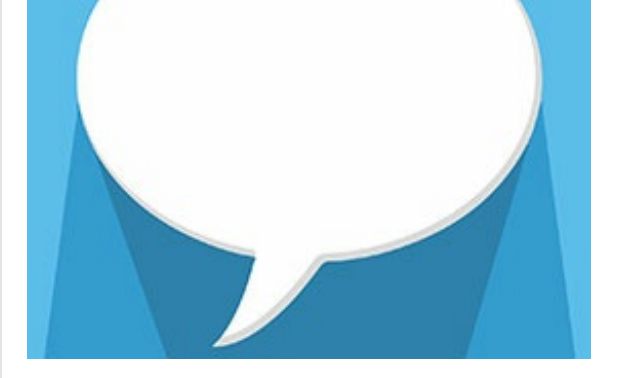
10 opportunities for nonprofit board members to tell stories. Easing board members into fundraising can be a rewarding and fun process, especially if they focus on just telling stories.