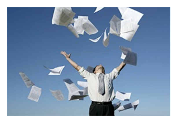
Advantages of a nonprofit going paperless. Many nonprofits have been able to adapt their document management software to paperless systems leading them to be more efficient, secure and financially responsible.