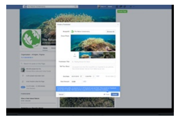
Coming to Facebook: Personal fundraisers. Starting in July, some U.S. Facebook users will be able to create campaigns for personal causes and donate to nonprofits.