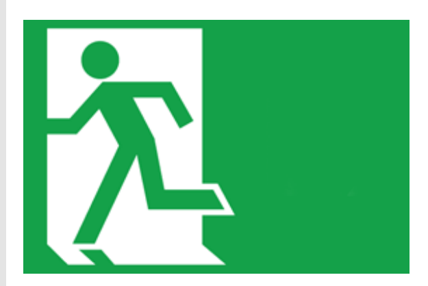
Turnover more turbulent than previously thought. New research finds that nonprofit executive leaders' turnover is often plagued with problems and doesn't mirror literature scenarios. Most nonprofit executives did not leave voluntarily.