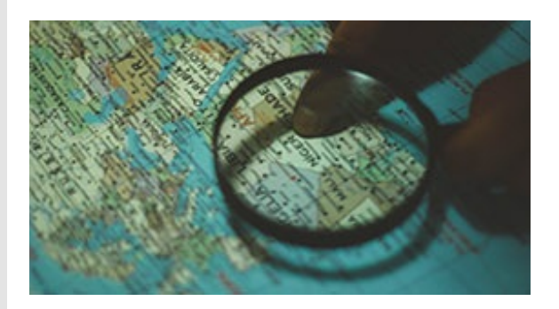
Family foundations expanding funding, targeting issues. Newer organizations — founded after 2010 — are less likely to base commitments on geography (40 percent) than organizations at least 45-years-old (78 percent). Newer foundations are more likely to commit to specific issues.