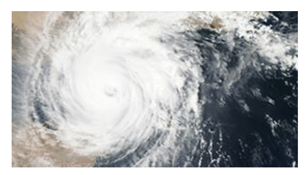
More relief aid should go to local incountry groups. Major international aid organizations say humanitarian crisis response could be drastically improved if more relief money went directly to nonprofits based in the conflict and disaster zones.